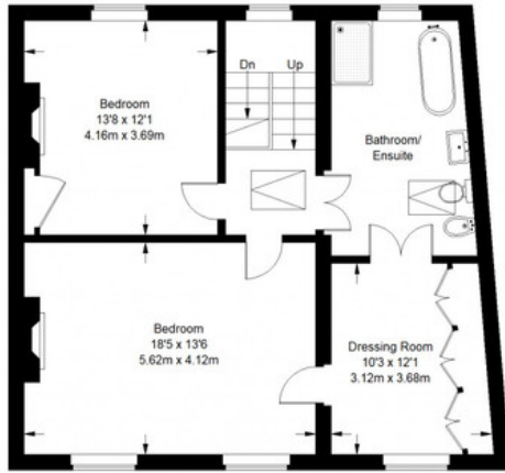
Second Floor = 792 sq ft