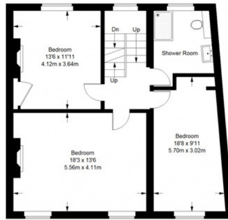
First Floor = 765 sq ft