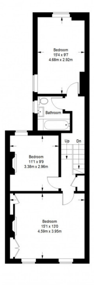
Basement = 342 sq ft