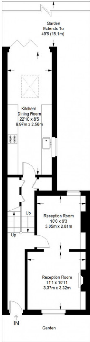
Ground Floor = 547 sq ft